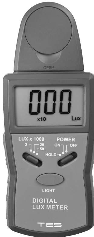
DIGITAL LUX METER