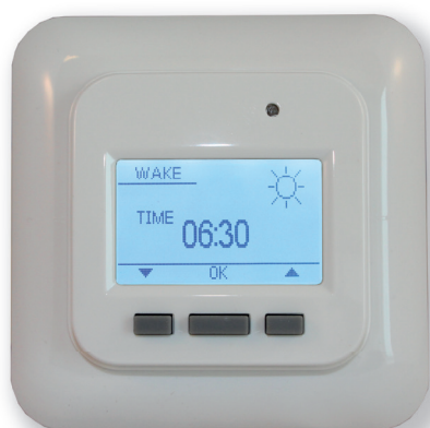
UFSTAT10 in Polar White

The 'Open Window' function monitors the room temperature for any sudden and sustained drops in air temperature, such as when a door or window is left open. If the thermostat sensors this situation it automatically switches off the heating system to stop wasting heat.